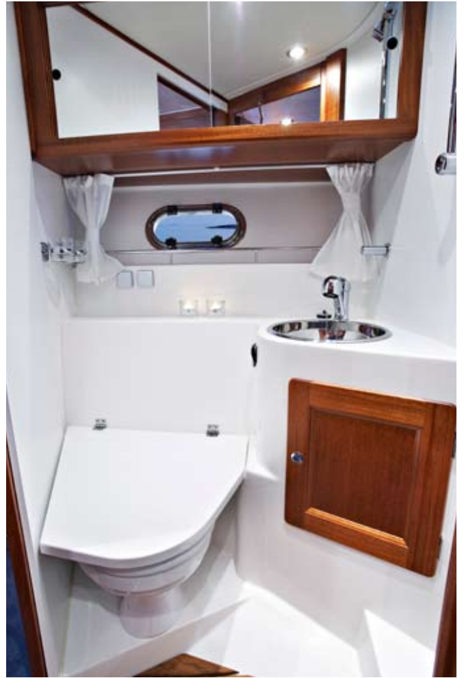
Port side shower and extra toilet in 3-cabin version