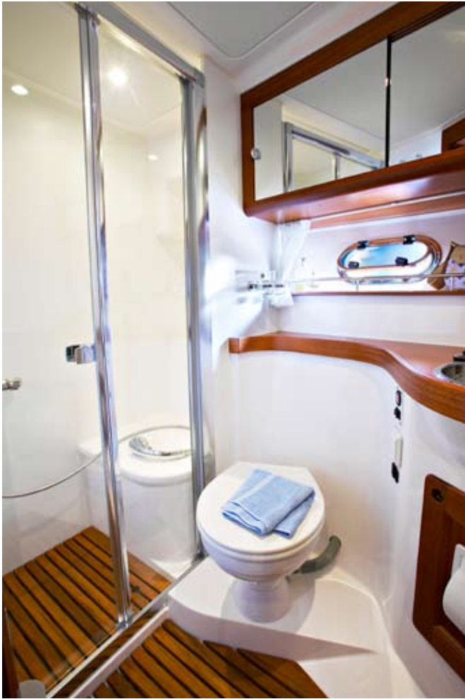
Port side owner's toilet and shower in 2-cabin version