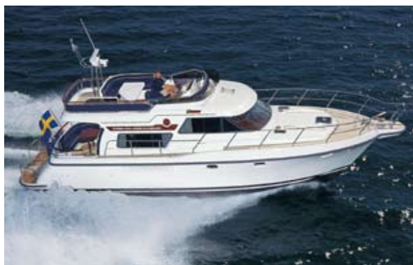
STOREBRO 475 COMMANDER