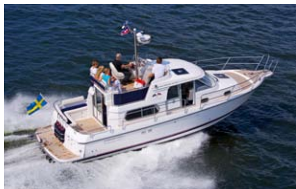
NIMBUS 340 COMMANDER