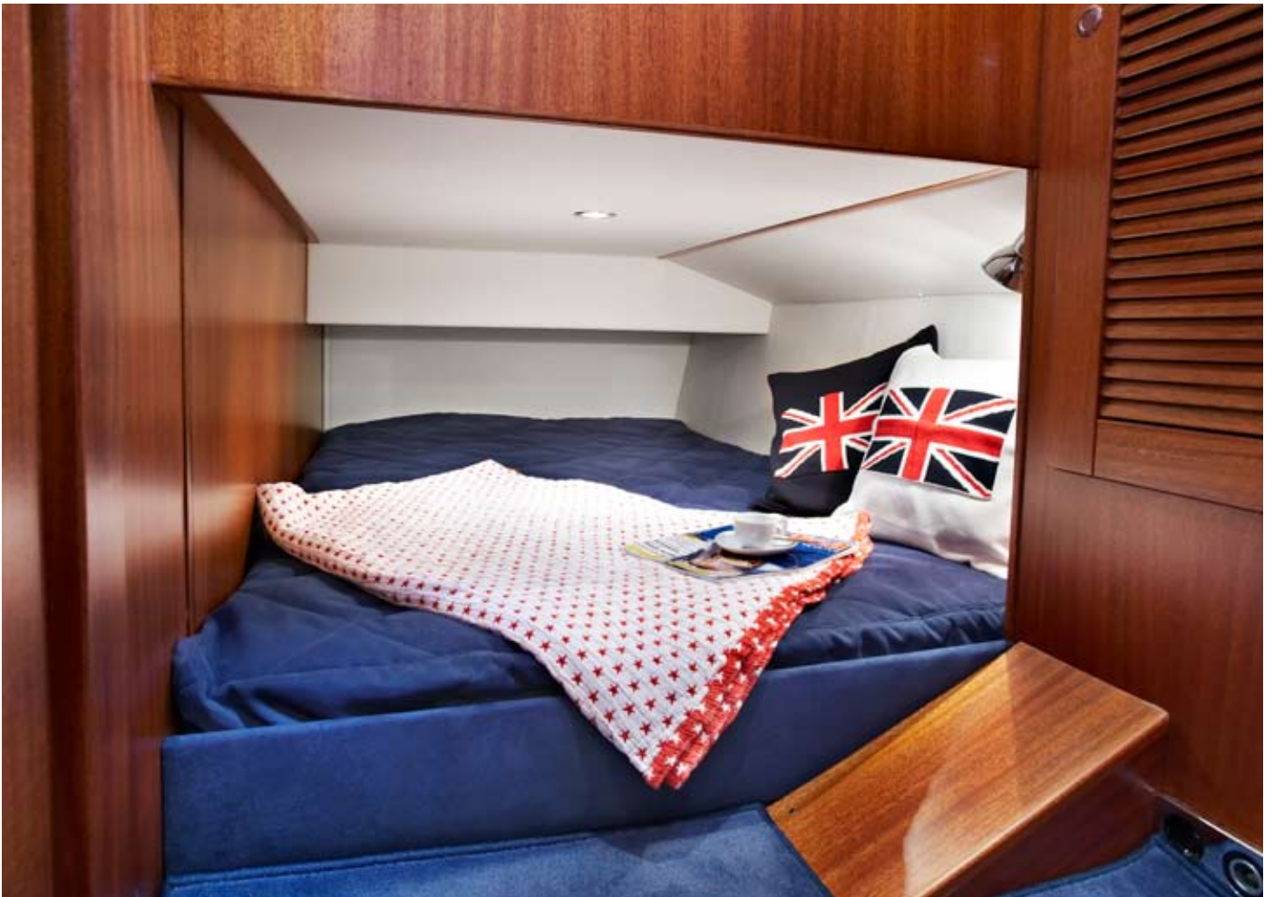
Extra guest cabin in 3-cabin version