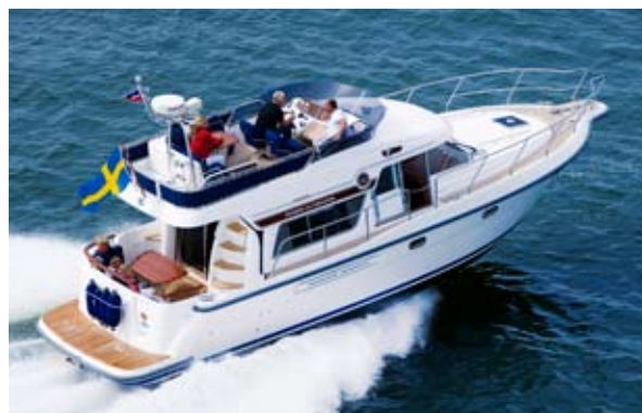
STOREBRO 410 COMMANDER