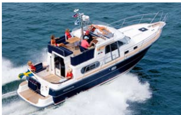
NIMBUS 380 COMMANDER